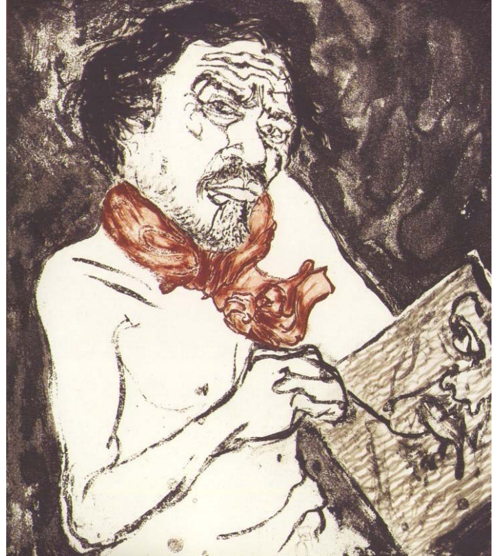
Francisco Toledo, Self-Portrait XXXVIII, 2000

US Opening of exhibition "Nurturing the Next Generation of Oaxacan Folk Artists," New York, NY