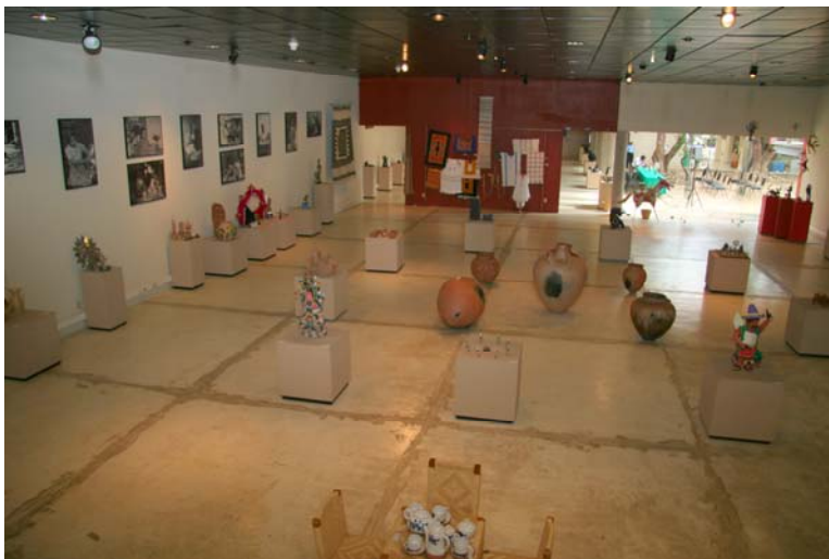
Come see the work of winning young artists (together with some senior “masters”) at the MEAPO gallery for three months starting around Mexico’s Day of the Dead festival in October 2008!